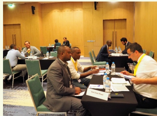
Programme: 24 - 26 October 2017